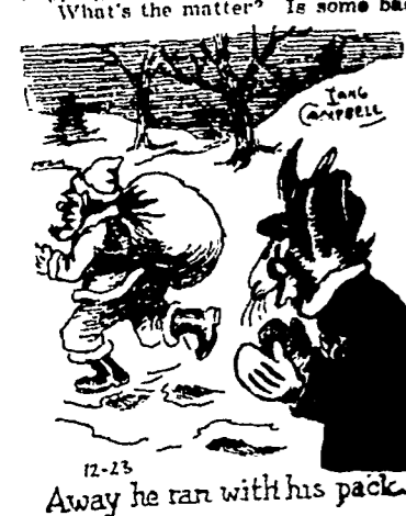
12-23 Away he ran with his pack.

When Uncle Wiggily started to hop to the woods one day to look for an adventure the bunny rabbit lit his lantern and behind him a servient of feet in the dried leaves.