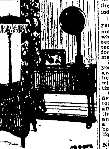
FOR THE RADIO FAN.

By MARIAN MOORE. Perhaps it is ten o'clock in the morning, and you have tuned in on a station where some woman is telling you how to make wonderful concoctions which will keep your husband's interest in the home table continually at par, or perhaps the seven o'clock bedtime stories are amusing the kiddies just before their last good night romp; maybe