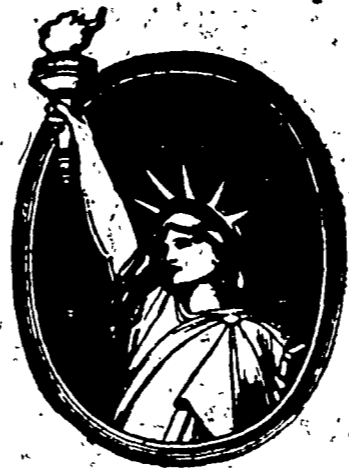
This, the Torch of the Statue of Liberty, symbolizes the beacon of Golden Values in this sale.

A Tuesday Temptation: Handsome Table Living Room Tables in the 48-inch size, made with neatly turned bases and beautiful figured Walnut tops, in the new Duco finish ..... $15.75 —Killians', Fourth Floor.