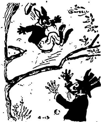
Sammie bounced with it!

"No," went on Sammie. "Have you?" "Cause if you have a penny, you could go to the store now, Uncle Wiggily, before it rains, and get a lollypop, couldn't you?"