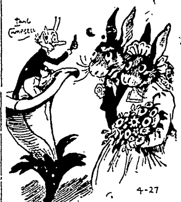
They were married by Jack-in-the-Pulpit.

thought of," answered Uncle Butter. "And now I'll get on my good clothes, for I want to look sleek and proper to see you married. I'll have my hoofs and horns polished." A little while after that Uncle Wiggily and Mrs. Jump, the rabbit widow, were wedded in a green